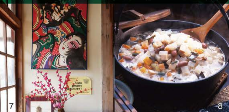
5. The Hinaya Teahouse, in a restored 140 year-old farmhouse on the grounds of Kanagi Genki Village "Kadarube" serves local dishes and confectionary made using local farm products. 6. The irori (open hearth) in the Hinaya Teahouse. This irori is used to grill fish or cook stews. 7. A view of the Hinaya Teahouse. 8. In winter, kenjiru stew, a special local favorite, is available. A simple dish made from daikon radish, carrot, burdock root and other vegetables, with mountain vegetables like fuki, warabi, and zenmai, as well as tofu products including deep-fried tofu, frozen and dried spongy tofu, or plain tofu as the basic ingredients, which are chopped up and stewed, seasoned with miso and soy sauce.